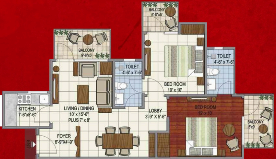
2 BHK Floor Plan : Super Area - 1014 sq.ft.