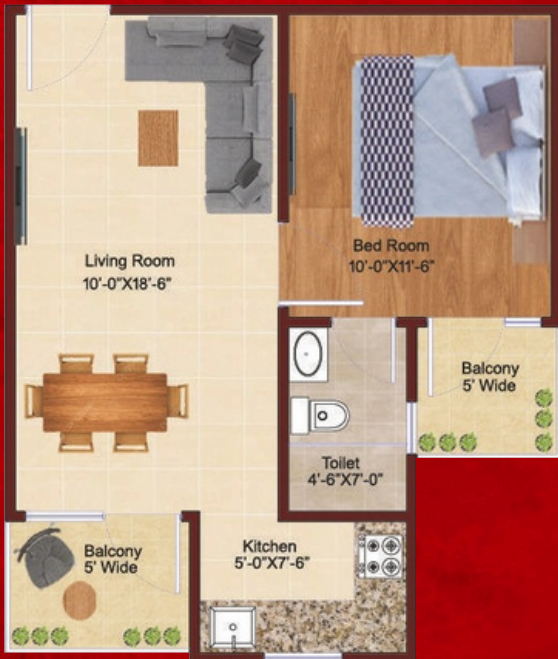
1 BHK Floor Plan : Super Area - 654 sq.ft.