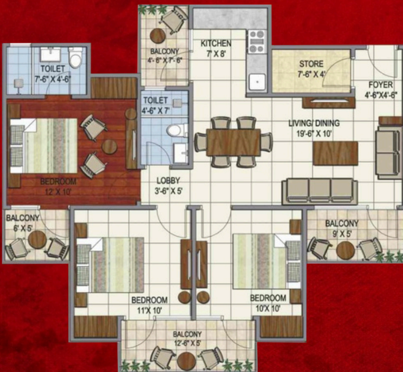
3 BHK Floor Plan : Super Area - 1300 sq.ft.